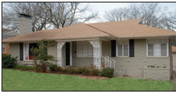
6921 Ellsworth | $314,999