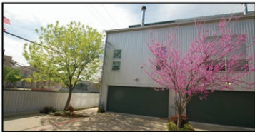
3801 San Jacinto #A | $219,000