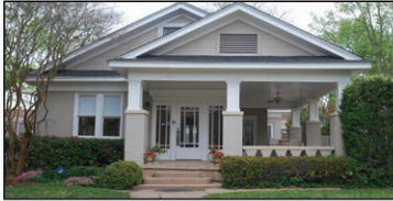
5723 Morningside | $399,000