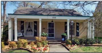
6938 Patricia | $230,000